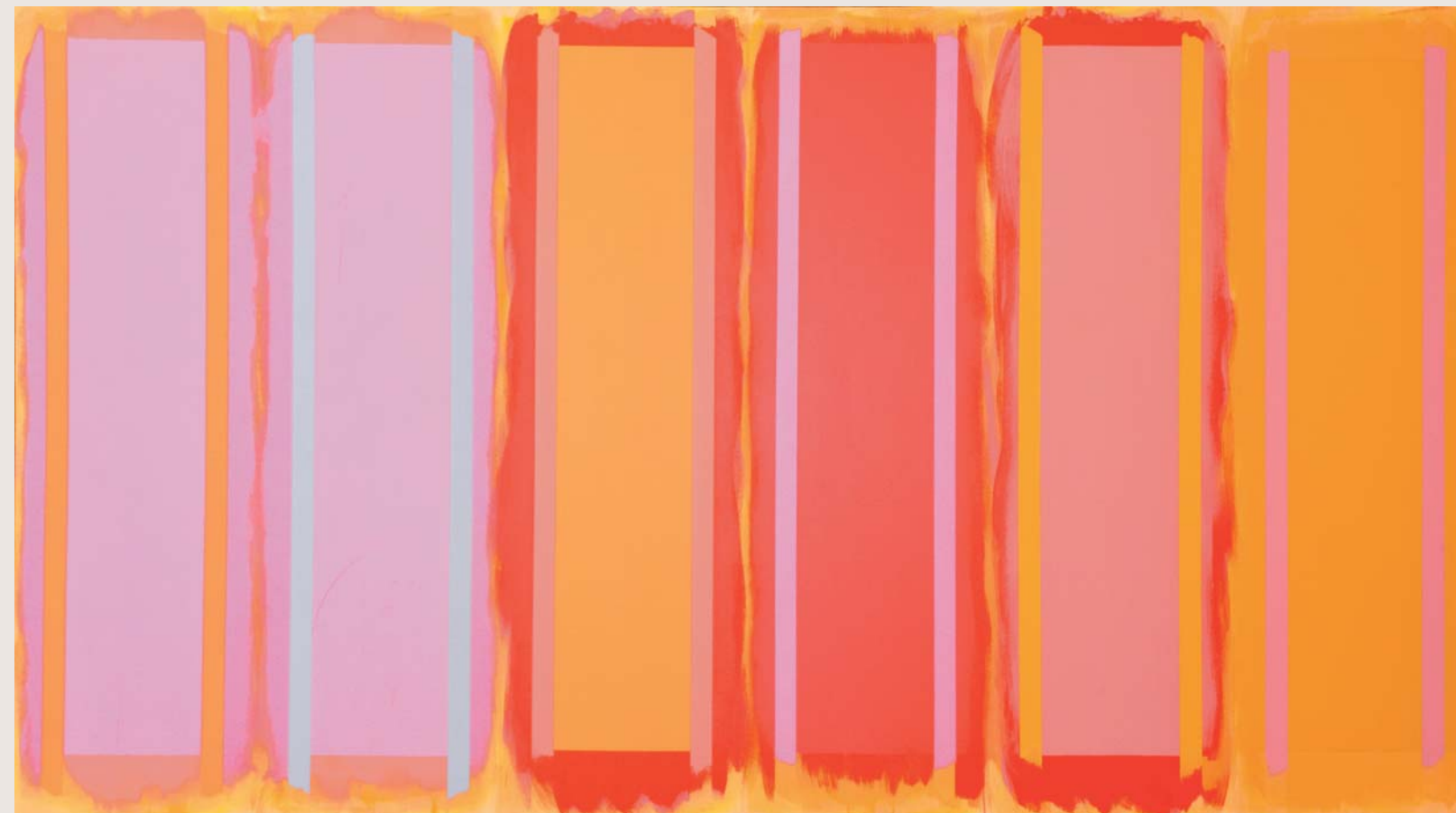
Parade Rest , 1996, Acrylic on canvas, 68 x 138 inches